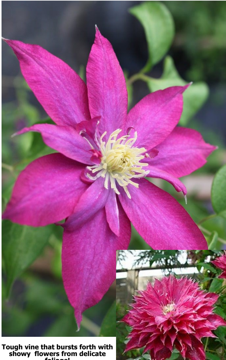
Tough vine that bursts forth with showy flowers from delicate foliage!