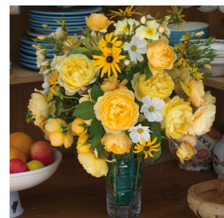
David Austin roses are prized for their unique combination of old rose charm (fragrance and flower shape) with the health and repeat-blooming qualities of modern roses, making them a gardener's favorite for their beauty, fragrance, and reliability.