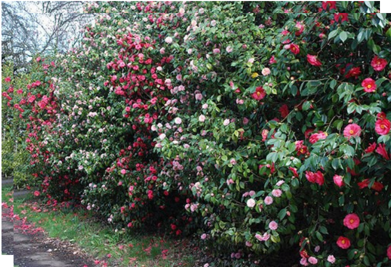
Grow a hedge of Camellias and add winter interest to your garden in shady areas.