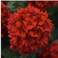
Verbena EnduraScape™ Red