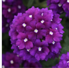
Verbena EnduraScape™ Purple