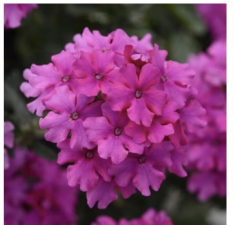
Verbena EnduraScape™ Magenta