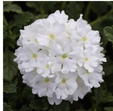
Verbena EnduraScape™ White