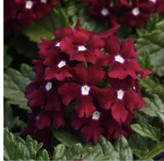
Verbena EnduraScape™ Burgundy