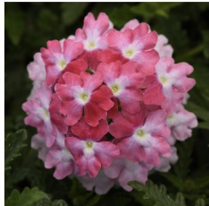
Verbena EnduraScape™ Pink Fizz