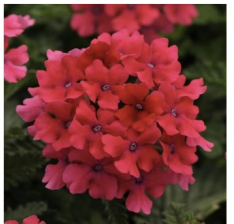
Verbena EnduraScape™ Hot Pink

Blooms for 5 months and comes back every year! Attracts butterflies.