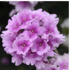
Verbena EnduraScape™ Pink Bicolor