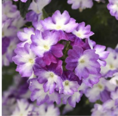
Verbena EnduraScape™ Purple Fizz