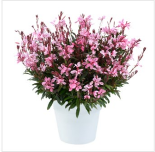
STEFFI™ Blush Pink Imp.