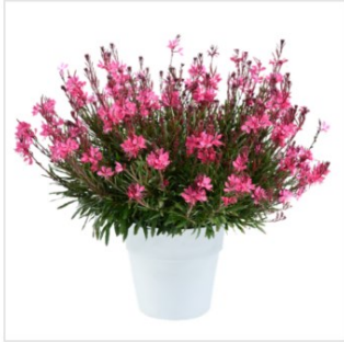
STEFFI™ Dark Rose Imp.