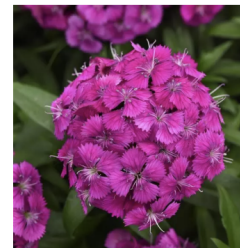
Dianthus Dart™ Purple