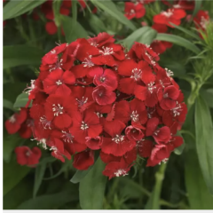
Dianthus Dart™ Scarlet