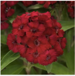
Dianthus Dart™ Raspberry