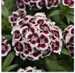
Dianthus Dart™ Red