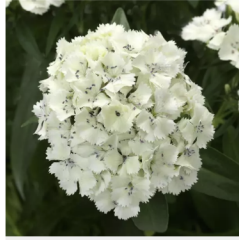
Dianthus Dart™ White