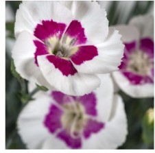
AMERICAN PIE® Berry à la Mode Dianthus