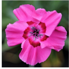
AMERICAN PIE® Bumbleberry Pie Dianthus