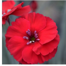
AMERICAN PIE® Cherry Pie Dianthus