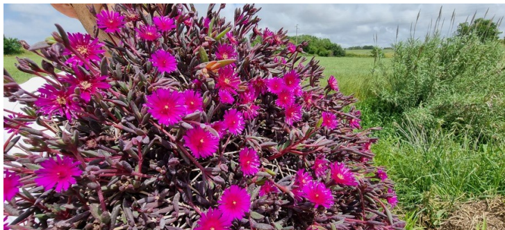
Purple ('FSDD2117') PP36,476