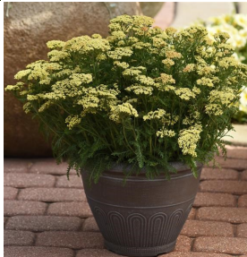
Milly Rock™ Yellow ( 'FLORAC HYE0' ) PP333259