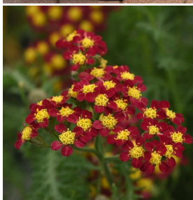
Milly Rock™ Red ( 'FLORAC HRE1' ) PP31757