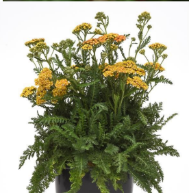
Milly Rock™ Terracotta ( 'FLORACH YE2' ) PP35113