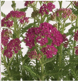
Milly Rock™ Rose ( 'FLORAC HRO1' ) PP31620