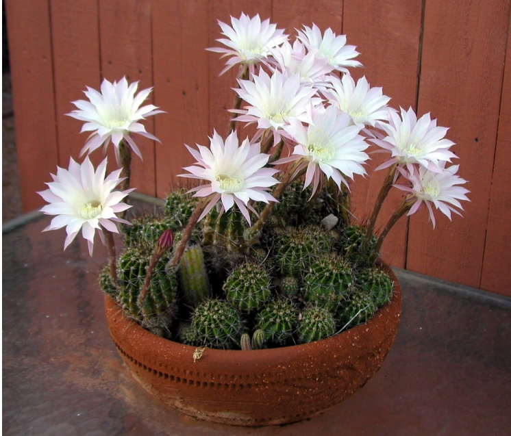
Use in rock container gardens in summer or as a house-plant in a sunny window.