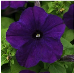
Petunia Pretty Flora Midnight Petunia x hybrida