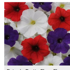
Petunia Pretty Flora Flag Mixture Petunia x hybrida