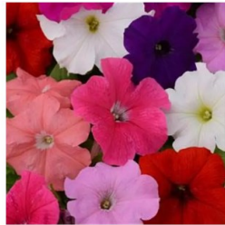
Petunia Pretty Flora Formula Mixture Petunia x hybrida