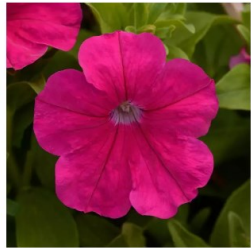
Petunia Pretty Flora Rose Petunia x hybrida