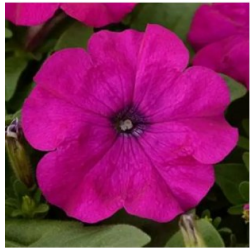
Petunia Pretty Flora Purple Petunia x hybrida