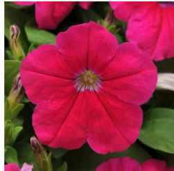
Petunia Pretty Flora Pink Petunia x hybrida