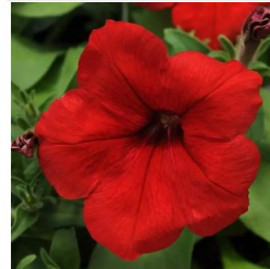
Petunia Pretty Flora Red Petunia x hybrida