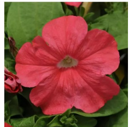
Petunia Pretty Flora Coral Petunia x hybrida