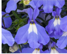
Heatopia™ Sky Blue Lobelia