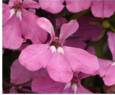
Heatopia™ Pink Lobelia