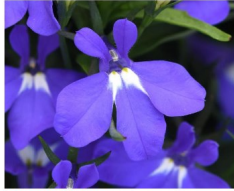
Heatopia™ Blue Lobelia