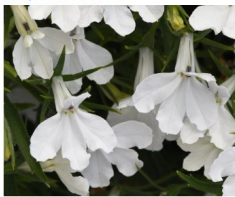
Heatopia™ White Lobelia