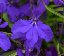
Heatopia™ Dark Blue Lobelia