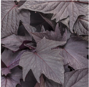
Bewitched After Midnight™