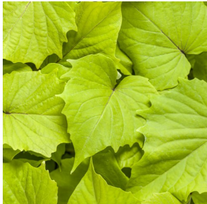
Bewitched Green With Envy™