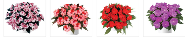
Harmony® Raspberry Cream Harmony® Salmon Cream Harmony® Bold Red Harmony® Dark Lilac