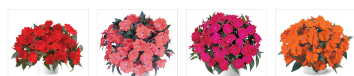
Harmony® Deep Red Harmony® Deep Salmon Harmony® Magenta Harmony® Orange Blaze