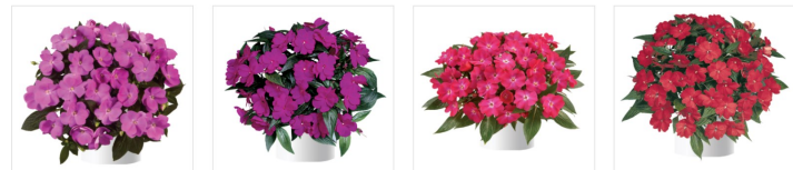
Harmony® Dark Lavender Harmony® Dark Violet Harmony® Dark Pink Harmony® Dark Red