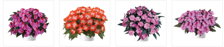
Harmony® Marshmallow Cream Harmony® Orange Star Harmony® Pink Cream Harmony® Purple Cream