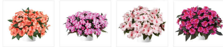
Harmony® Apricot Cream Harmony® Bubblegum Harmony® Candy Cream Harmony® Fuchsia Cream