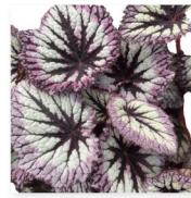
Begonia rex Spirit of Flores