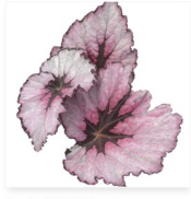
Begonia rex Spirit of Kwale