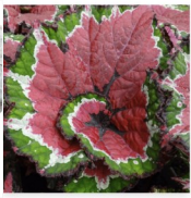
Begonia rex Spirit of Galbe