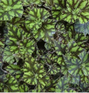
Begonia rex Spirit of Mauritius