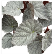
Begonia rex Spirit of Sulawesi