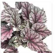
Begonia rex Spirit of Sumatra