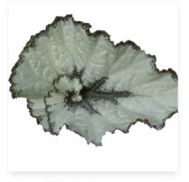
Begonia rex Spirit of Java