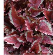
Begonia rex Spirit of Mayotte