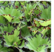
Begonia rex Spirit of Pemba