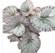
Begonia rex Spirit of Bali