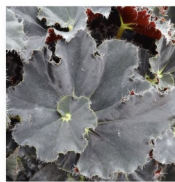
Begonia rex Spirit of Zanzibar

Rex begonia offers colorful foliage and is one of the most interesting indoor plants around. Despite its exotic looks, Rex begonia is actually easy to grow. Because it's a relatively short houseplant,