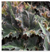
Begonia rex Spirit of Comares