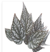
Begonia rex Spirit of Maldives