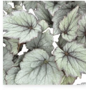
Begonia rex Spirit of Laccadive