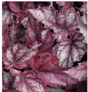
Begonia rex Spirit of Reunion