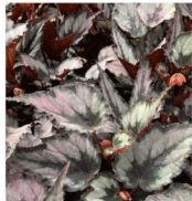
Begonia rex Spirit of Seychelles