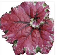
Begonia rex Spirit of Mafia